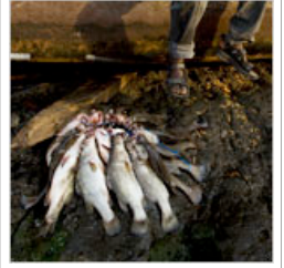
Tiny Island Surrounded by Ripples of Dispute

The debate over education degrees and teacher performance.