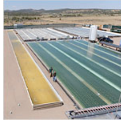
Tribe in Colorado Invests in Algae Fuel