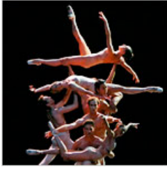
Meeting of Many Minds (and Bodies)