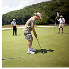
Association of Golf Club With A.I.G. Still Rankles