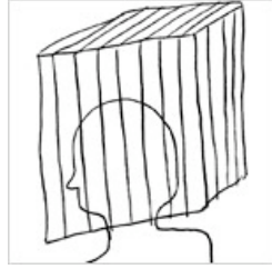
Letters: Young, Mentally Ill and Behind Bars