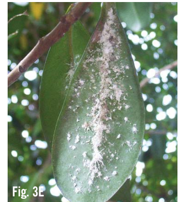
(A) Sections of air potato stem that had been defoliated by unknown herbivores (possibly sawfly larvae). The damage appeared to be several months old. (B) Pagoda bagworm ( Pagodiella hekmeyeri ) to the right of a damage hole formed by removal of a circular disc of leaf lamina. The bagworm scrapes the chlorophyll off the leaf before incising cleanly around the area consumed. The excised leaf disc is then added to the bagworm's protective case. (D) Signs of Chrysomelid damage on the underside of a shoebutton ardisia leaf. The beetle scrapes out small patches on the underside of the leaf, resulting in a spot-like damage pattern. (E) Mealybugs observed on shoebutton ardisia during an earlier trip (Dec 2004).

Although all plants were fruiting copiously, no fruit feeders were observed and most of the damage to foliage was restricted to the lower half of the canopies. Some of the damage to shoebutton ardisia also appeared to be seasonal, Natural History Museum, London. For example, fresh leaf miner damage was observed only on some plants even though there were exit holes of leaf miners on all plants. In December 2004, Ewe found some shoebutton ardisia growing in FRIM infested with a mealybug (Fig. 3E), probably Rastrococcus spinosus (Robinson) (Homoptera: Pseudococcidae), but none of these insects were found on the same plants in June 2005. The general appearance of the mealybug colony at the time suggests they may have been in decline due to natural control by predators and parasitoids.