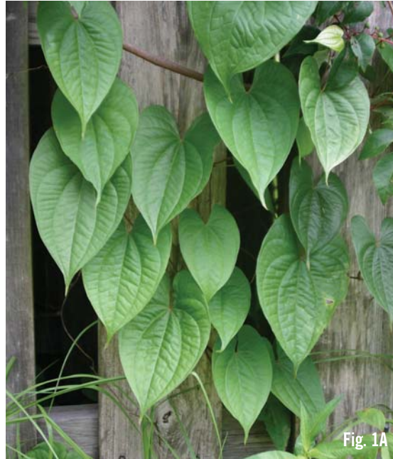
Fig. 1A Air potato growing behind the primary author's house in Osceola County, Florida.

The presence of air potato was first recorded in Florida in 1905 (Morton 1976) but the introduction of this species to North America can most likely be attributed to slave ships from Africa (Coursey 1967). It is believed to have originated in Asia but is found all over the tropics in Asia and Africa (Martin 1974). This plant has been cultivated in home gardens as a food source for such an extensive period that wide diversity is observed in species morphology throughout the Old World (Coursey 1967, Martin 1974). It remains an important food crop in sub-Saharan Africa ( http://www.cgiar.org/impact/research/yam.html ) where the tubers can be easily stored for up to 6 months as an emergency food source. It is less important in Southeast Asia where economic development has reduced the need for long-term food storage. Despite being noted in the floras of Central and South America, the air potato is not an important food source in the New World (Martin 1974).