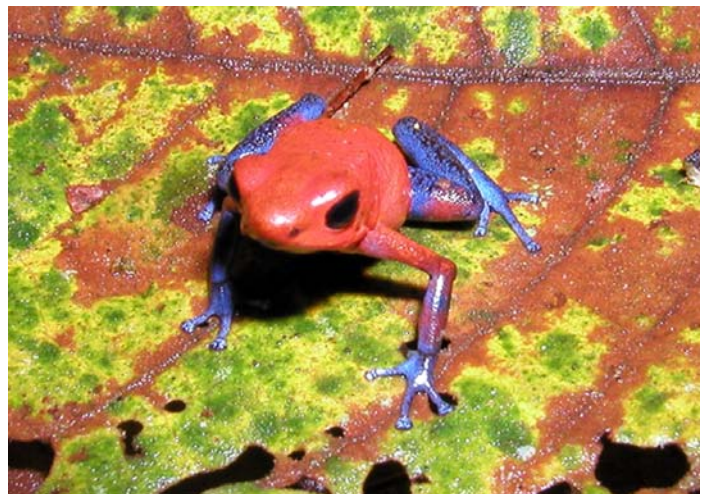
The Strawberry Poison Dart Frog ( Oophaga pumilio ) is the most common frog species at the team’s field site.

“Amphibians are very sensitive bio-indicators that respond quickly to deteriorating environmental quality - they have been likened to the ‘canary in the coal mine,’” said Whitfield. “If these sensitive species are in decline, it may be a sign that other species, or even human health, will soon be at risk.”