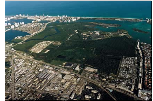
Shown here is an aerial view of the Florida International University Biscayne Bay Campus.

The Biscayne Bay Society will host an array of different cultural and culinary events and activities on the 2nd Tuesday of each month from October 2004 through June 2005.