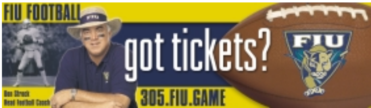
Billboards will be up around Miami-Dade and Broward counties during the summer months. You can see them at five different locations including: I-95 and Pembroke Road and Bird Road, one mile west of 72nd Avenue.

With the beginning of its first football season just three months away, Florida International University is launching its first ticket campaign – a multifaceted marketing effort organizers hope will fill the school's 17,500-seat stadium for all seven home games this fall.