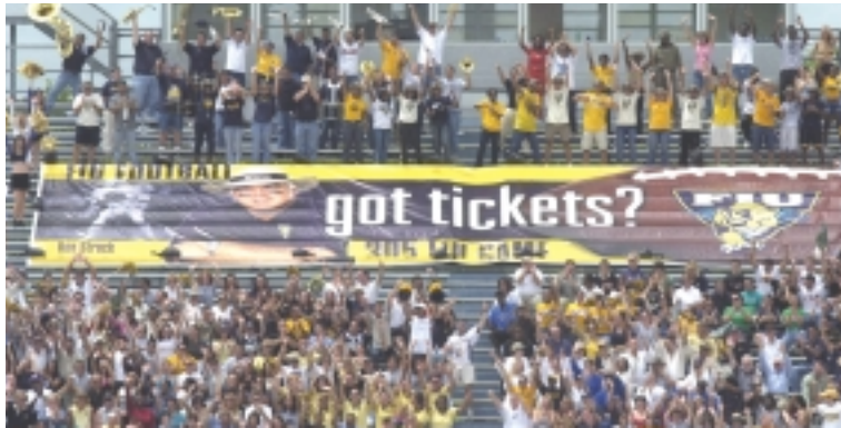
One of the new 14" x 48" billboards being used for FIU's football season ticket campaign was unveiled for hundreds of fans.